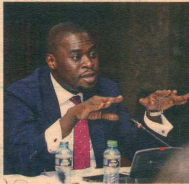
Nairobi governor Johnson Sakaja in Nairobi on February 14, 2023.

"This amount represented a decrease of 28.3 percent compared to Sh3.81 billion realised in a similar period in Financial Year 2021/22,"